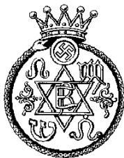
Blavatsky's personal seal

At the same time that a secret nature was being considered for the Society (in March 1876), a seal was designed, based on Blavatsky's personal seal, which she used on her notepaper. The seal, unlike the secret aspects of the Society, has survived until the present.